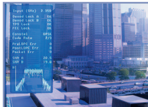
On-screen diagnostics including RSSI